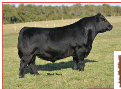
PVF Insight 0129, the sire of the Tradition Continues embryo package, is a son of SAV Brilliance8077.