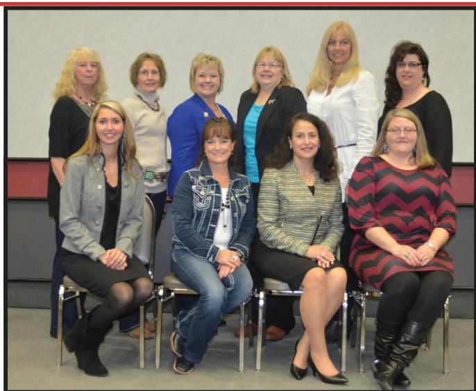
2014 Officers and Regional Directors