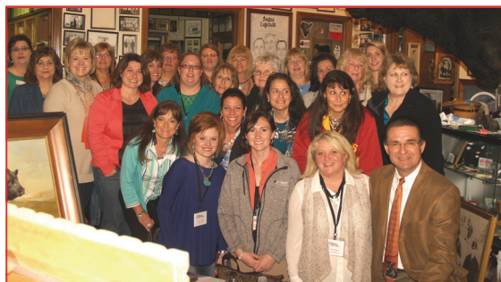
Participants toured and visited the American Angus Hall of Fame, Smithville, MO

—News Release provided by American Angus Association