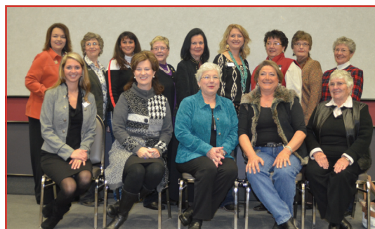
These past presidents attended the American Angus Auxiliary Annual meeting and breakfast in Louisville, Ky, November 2013. All past president are voting members of the executive board. The past presidents also met for their annual luncheon.

The Auxiliary Post is published twice a year; in the spring and fall. To keep informed of Auxiliary projects and events between issues of The Post look for Auxiliary Notes in the Angus Journal or visit www.angusauxiliary.com . The officers and regional directors welcome your emails and calls, see page 2 for contact information.