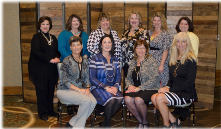
2018 executive committee— officers and regional directors

By August 1, 2018 This form may be duplicated.