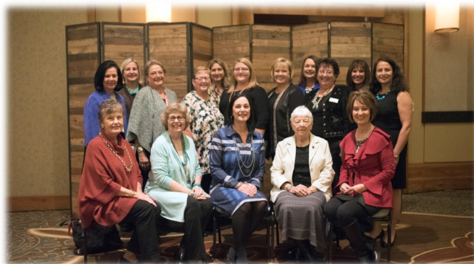
Past Presidents at the 2017 annual meeting in Fort Worth, TX

Come have fun in Madison, Wisconsin as the American Angus Auxiliary hosts a Scholarship Workshop at 3:00 pm on July 10, 2018 in the Exhibition Hall during the National Junior Angus Show. Learn how to help juniors turn in their Certificate of Achievements and apply for their Bronze and Silver Awards, needed for the Auxiliary Scholarships. This workshop will lead you towards scholarship success!