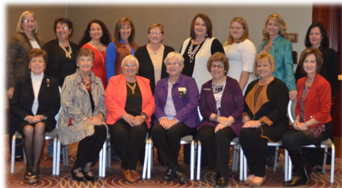
Past Presidents at the 2016 annual meeting in Indianapolis, IN

Book release party will be held at our Mid-Year meeting during NJAS, Des Moines, July 12 th . Following this, the book will be available at the Angus Gift Barn and online