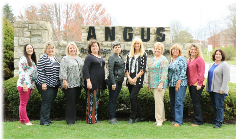
2017 executive committee— officers and regional directors

By August 1, 2017 This form may be duplicated.