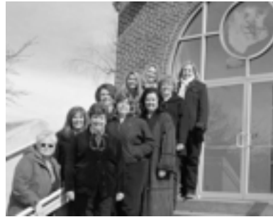
American Angus Auxiliary Executive Board Members gather outside the American Angus Association following the spring meeting.

Many of the innovative ideas, membership activities and changes are highlighted in this newsletter. We encourage everyone to join in on the fun. If you have questions or concerns please feel free to contact an Angus Auxiliary officer or director.