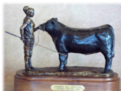
Champs All Around