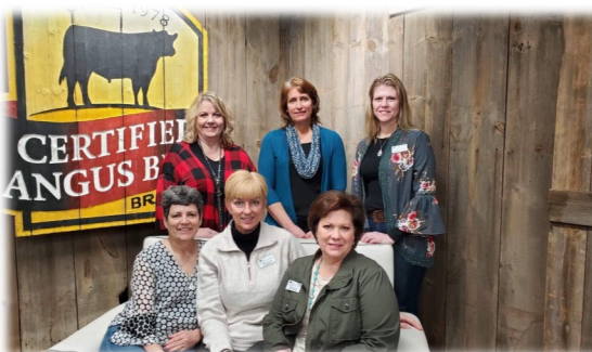
Officers and Regional Directors at the 2019 Spring Meeting at CAB

Look for reports from Regions 2, 4 & 6 in the fall issue of the Auxiliary Post