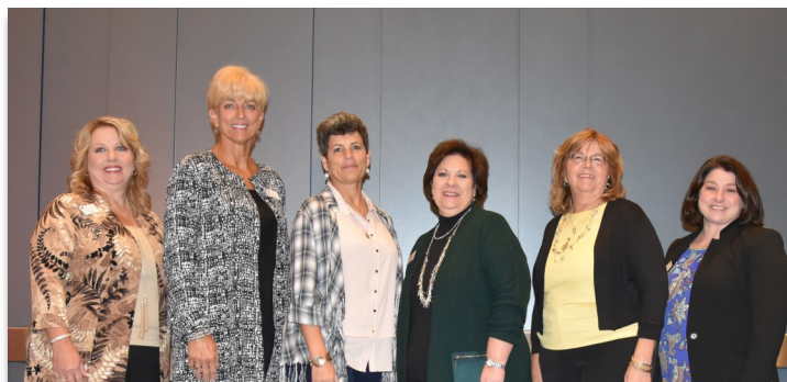
2019-2020 Executive Officer Team

Deadline August 1, 2019 This form may be duplicated