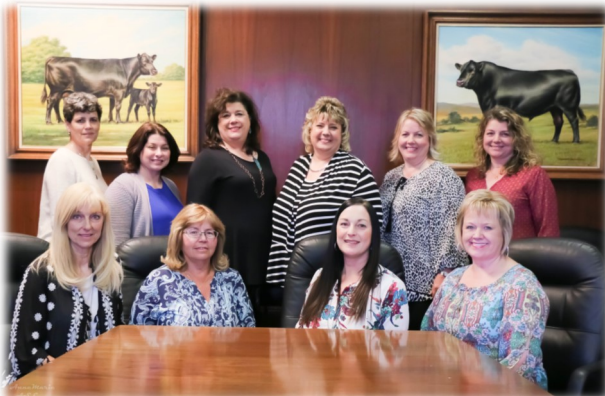
2017 executive committee— officers and regional directors

Join the team that makes all of this possible – we want you to help us promote the Angus breed and support our future generation. We need more hands to help and make the load lighter. Our team works hard and we want you to be a part... "Many hands make light work."