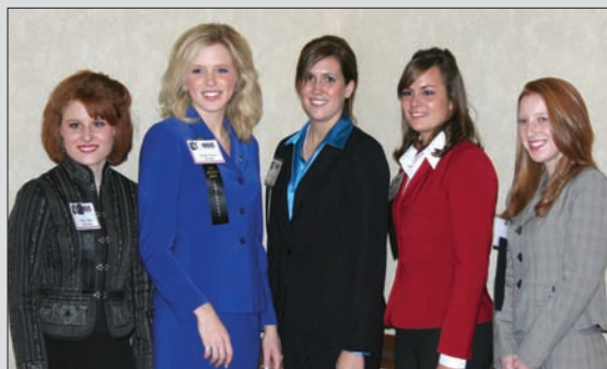
►Five contestants vied for the title of Miss American Angus Saturday and Sunday during the NAILE. They earned the right to compete through the American Angus Auxiliary's girls' scholarship competition earlier this year. The five competed via a written quiz, interview, impromptu questions and by preparing a speech.