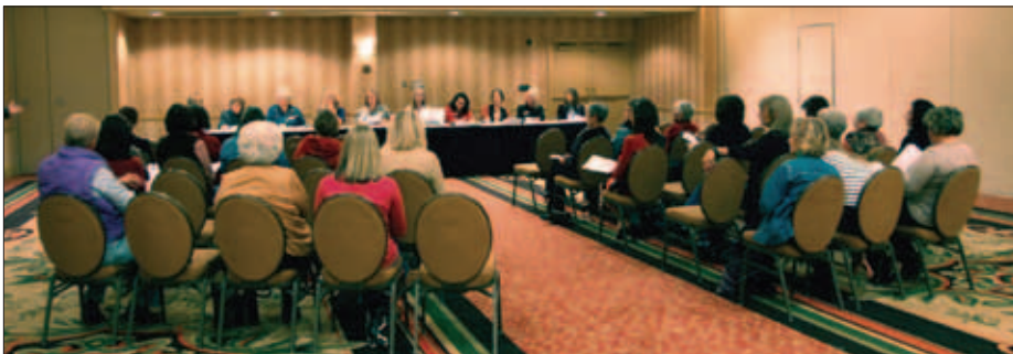
►The American Angus Auxiliary conducted its annual meeting Saturday, Nov. 12, during Angus events at the North American International Livestock Exposition in Louisville, Ky.