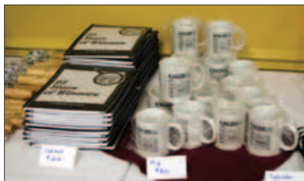
►Fairgoers could visit The Holiday Room and purchase items from the Auxiliary's Ways and Means Committee throughout the week.