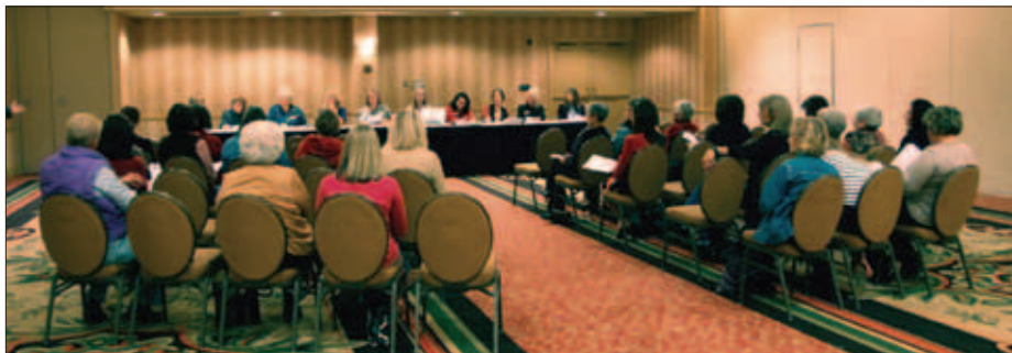
►The American Angus Auxiliary conducted its annual meeting Saturday, Nov. 12, during Angus events at the North American International Livestock Exposition in Louisville, Ky.