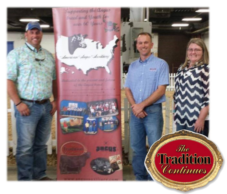
The 2014 "The Tradition Continues" project raised $5200 for our Scholarship and Awards Endowments. We thank Prairie View Farms, Gridley, IL for their generous donation of and embryo package and Horstman Cattle Co. for purchasing the embryos. The auction took place during the All American Breeders Futurity in Louisville, KY in June.